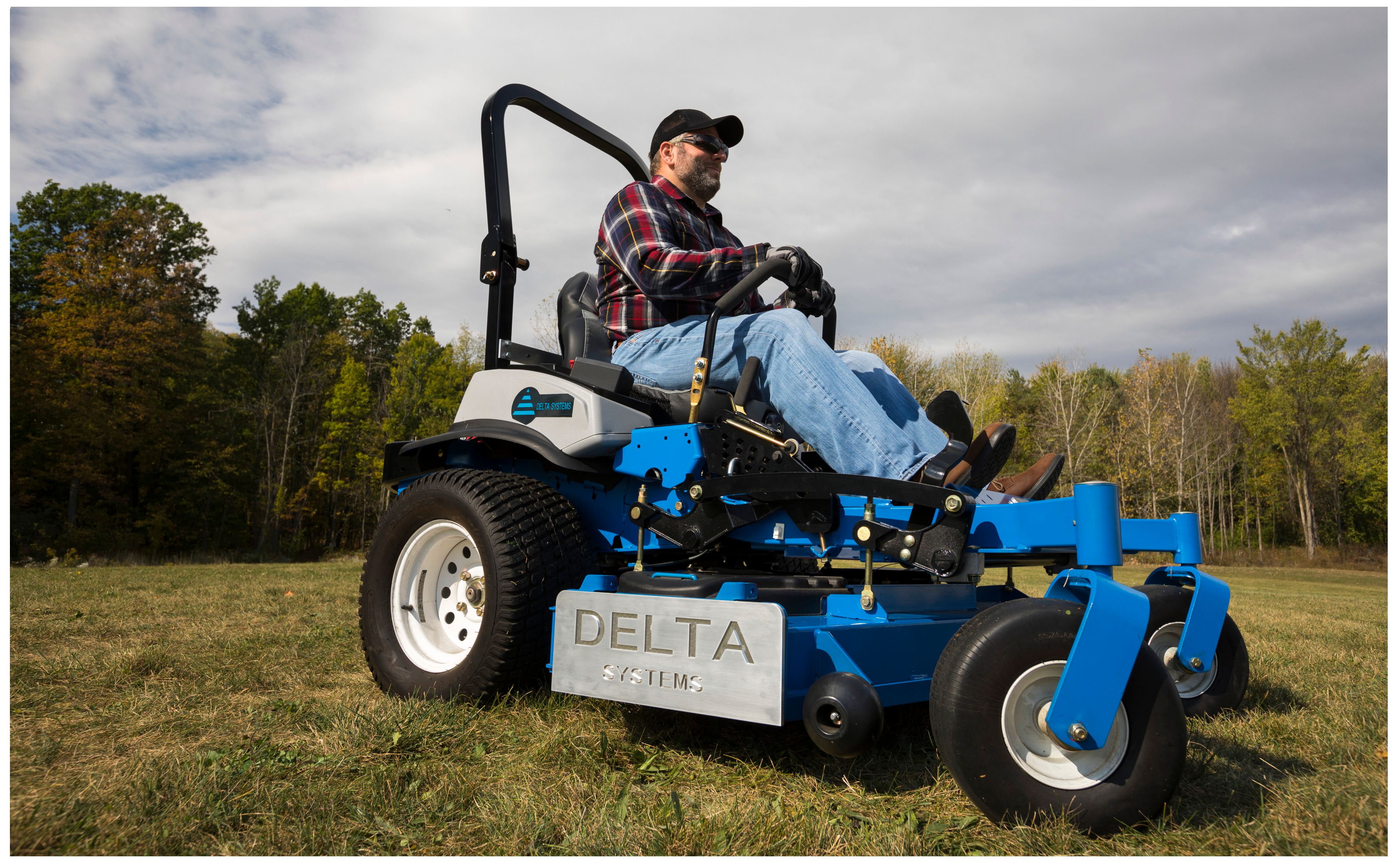
To demonstrate its range of control and connectivity solutions, Ohio-based Delta Systems developed a pair of Tech Tractors, including one based on an Exmark commercial zero-turn radius mower. The Tech Tractor incorporates a range of technologies, including a pushbutton start system, touchscreen display, backup camera and object detection system and Bluetooth-enabled monitoring system.